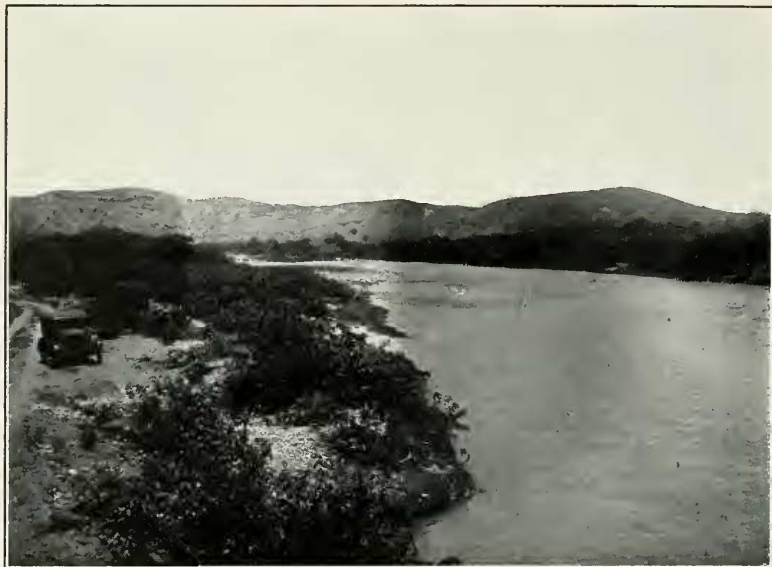
RÍO YAQUE DEL SUR

At Boca del Baos, Dominican Republic, May 19, 1931.